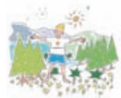
▲ Donation to Ichimura Nature School in Kyushu