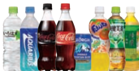
▲ Coca-Cola products